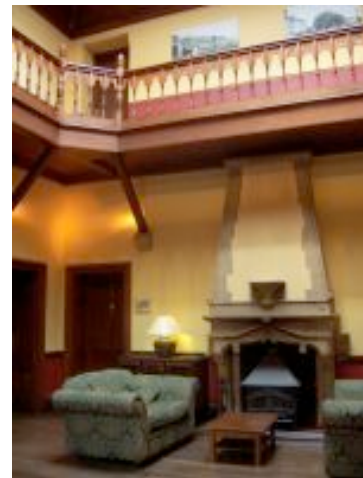
The minstrel's gallery at the hostel